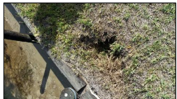
As can be seen on the above pictures, there is no remaining indigenous riparian vegetation on the banks of the river at this site. The area is covered by kikuyu lawns.