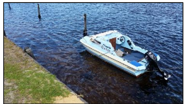
Creosote timber retaining wall and mooring poles that currently exist on Silverstreams Estate. This is not ideal as it results in owners trampling the intertidal zone at low tide to reach their boats.