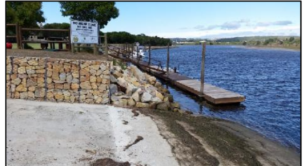
Existing slipway and recently upgraded retaining structure and floating jetty on Blue Waters Estate (adjacent property).