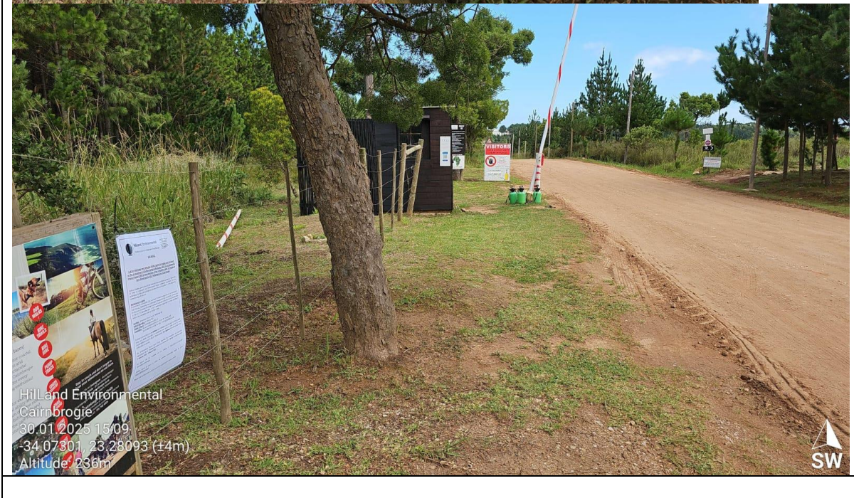
Hill and Environmental Cairnbrogie 30.01.2025 15:09 -34.07301, 23.28093 (±4m) Altitude: 236m