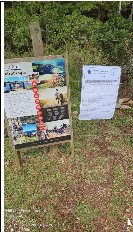
Hill and Environmental Cairnbrogie 30.01.2025 15:09 -34.07302, 23.28094 (±4m) Altitude: 235m

Site notice placed up on 31 January 2025