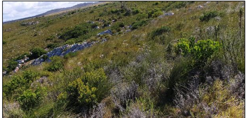
Fynbos vegetation present within the protected area

No sensitive vegetation present on the boundary