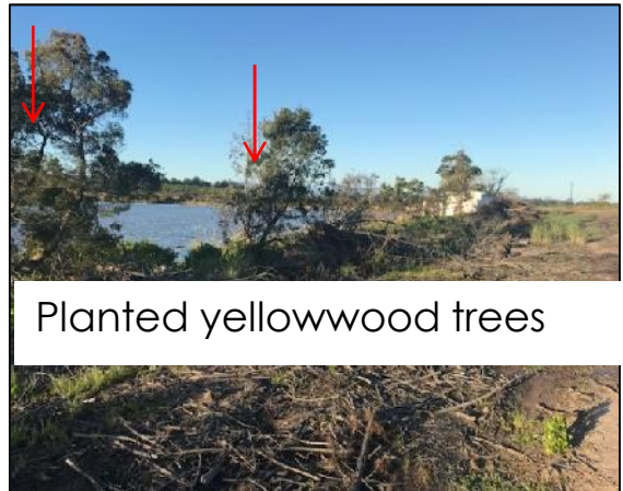
Planted yellowwood trees