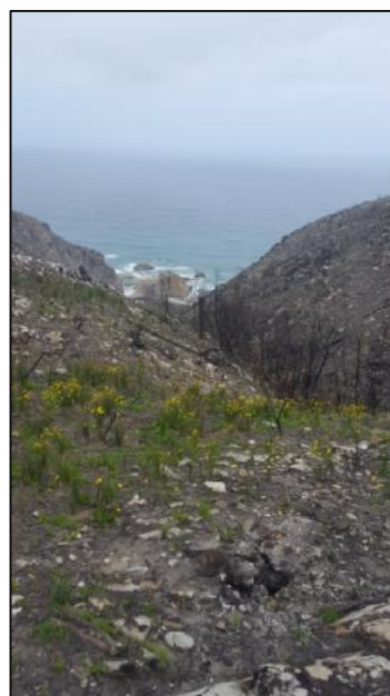
Steeper slopes of southern boundary of Cairnbrogie