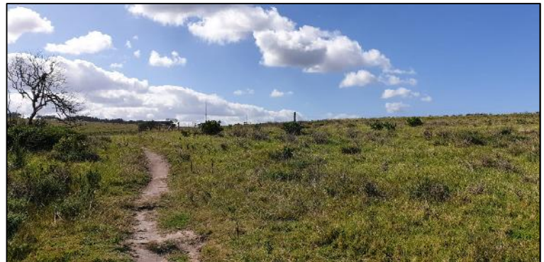
Existing hiking trail / bicycle track on Cairnbrogie