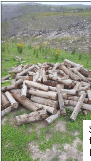
Stockpile of wood from felled alien trees