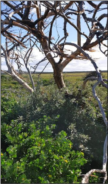
Vegetation on the edge of the protected area, bordering the camp area 2. Moribund vegetation as a result of 2017 fires and pioneer species

No sensitive vegetation present on the boundary