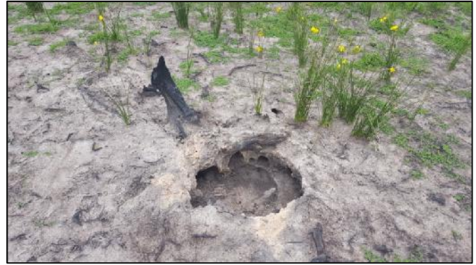
Soil collapse caused by roots that were burnt by fires on the property and have since disintegrated, leaving air pockets beneath the surface.