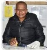
Clark's diligence results in arrest