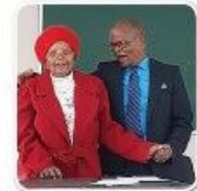
Local celebrates 100th birthday