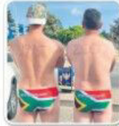
Hartenbossers draf Fal-styl