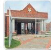
Hof hoor van dreigement, foto's