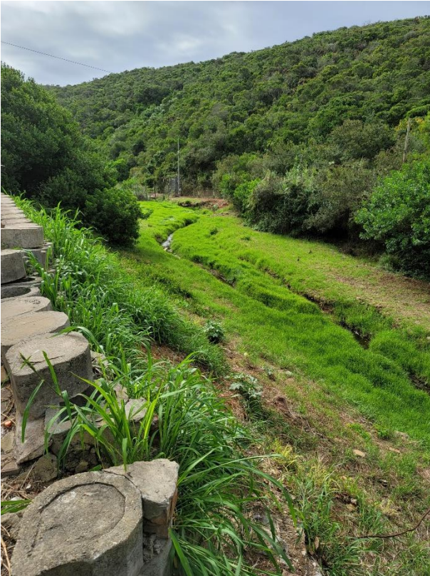
Upstream of the preferred site plan – no work proposed