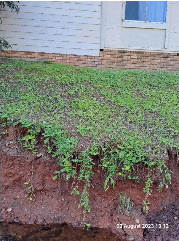
Current state of the channel and side slopes