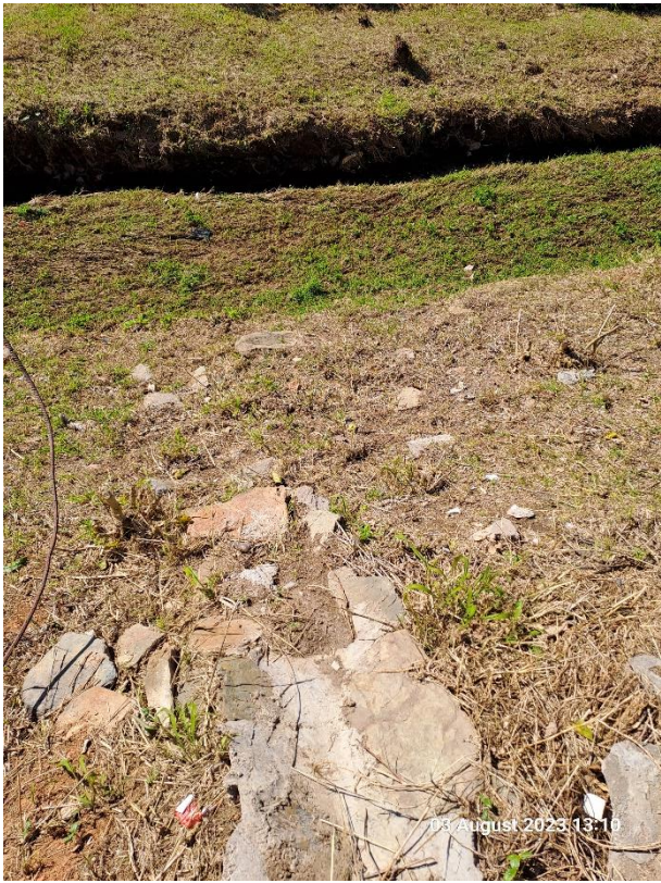
Proposed area for the access ramp