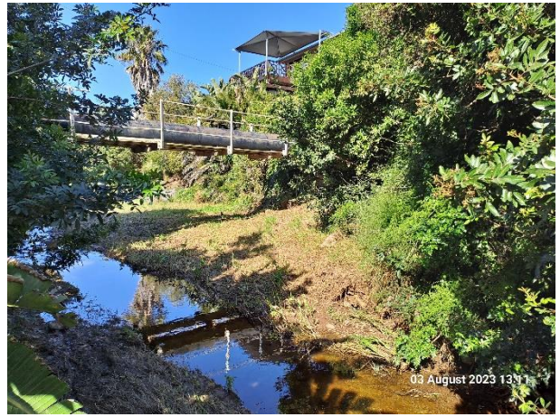
Approximate position where works will terminate