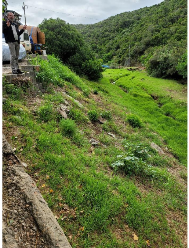
Current state of the side slopes with ad-hoc protection