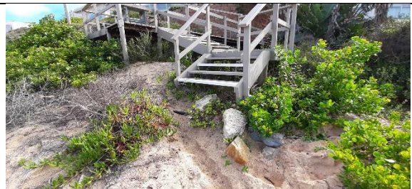
Image 6: Footings under step entrances from houses require attention - as part of the ongoing Maintenance Management Plan