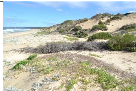
Image 4: Cut brush used as natural fencing for wind and sand protection, to encourage dune rehabilitation, still in place and functional.