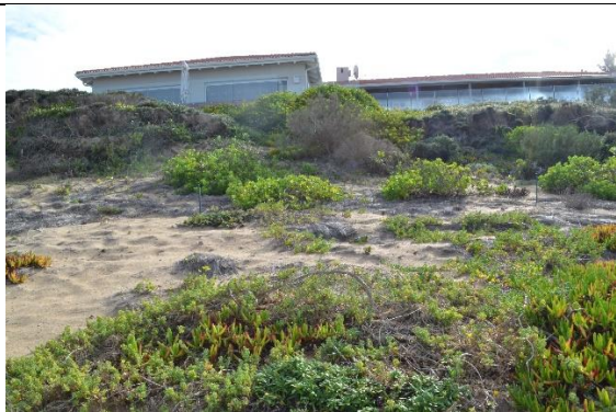
Image 11: Dune vegetation establishment has been aided by water from irrigation sprinklers