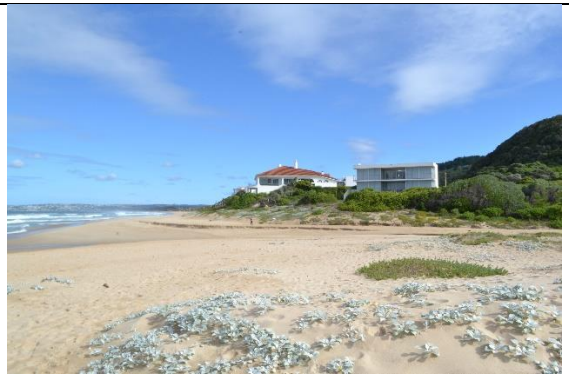
Image 12: View across the stream looking towards the west, towards the site