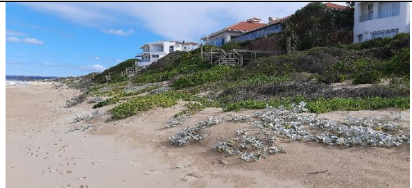
Image 2: Rehabilitated dune vegetation showing good coverage, view to the south-west.