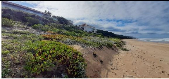
Image 1: Rehabilitated dune vegetation showing good coverage, view to the north-east.