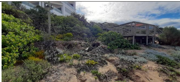
Image 5: Stormwater outfalls between housing require attention, to mitigate against soil erosion - as part of the ongoing Maintenance Management Plan