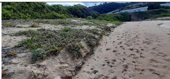
Image 7: Some scour has occurred along the stream edge, east section of site. This is to be expected and will be ongoing, to be monitored and repaired as part of the Maintenance Management Plan.