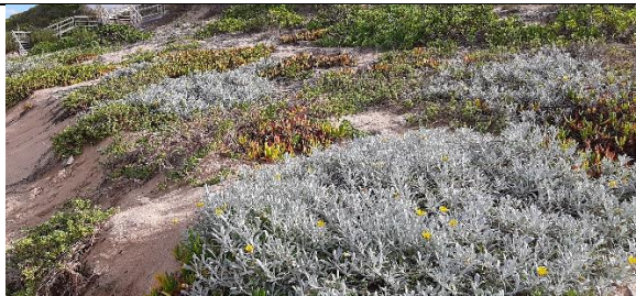
Image 3: Close up view of successfully established dune plant species.