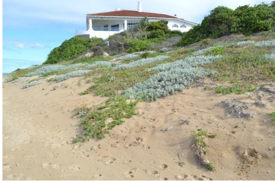
Image 9: Construction vehicle access between houses has recovered well and is showing good rehabilitation results.